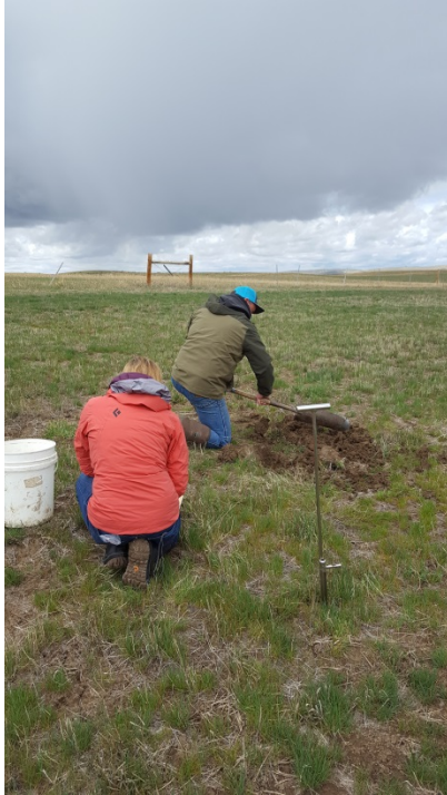
Taking Soil Samples at Local Ranches